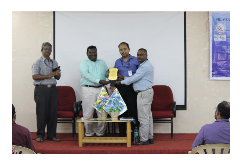
Valedictory Function Photos